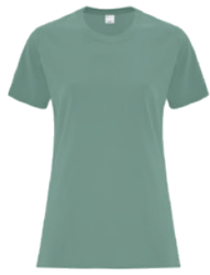
LAUREL GREEN 4198C