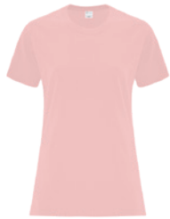
PALE BLUSH 5025C