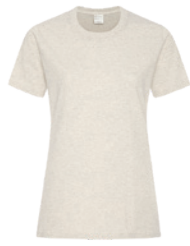
OATMEAL HEATHER*** Warm Grey 2C

*90/10 cotton/polyester **50/50 cotton/polyester ***98/2 cotton/polyester