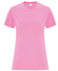
CANDY PINK 189C