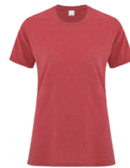
HEATHER RED** 193C