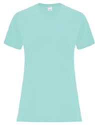
TRUE CELADON 7464C