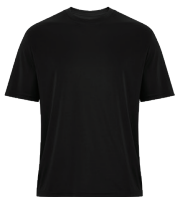
BLACK Black 6C

Textile fabric colours are subject to dye lot variation and will not be exact match to print pantone reference