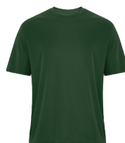
FOREST GREEN 7736C

Due to the nature of polyester, special care must be taken throughout the decoration process.