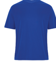
TRUE ROYAL 4154C