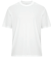
WHITE No PMS