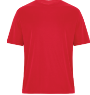
TRUE RED 200C