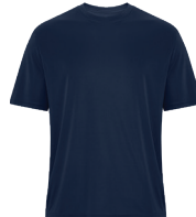
TRUE NAVY 539C