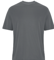
COAL GREY Cool Grey 10C