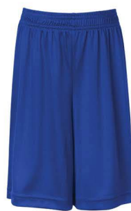
Between 7686C & 7687C