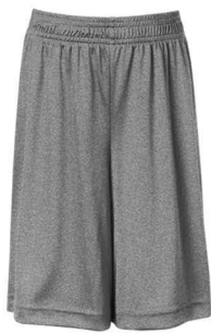
Cool Grey 10C