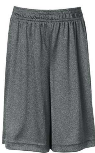
425C + 426C